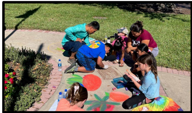
Students practicing at the 2022 street painting workshop