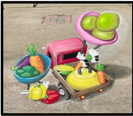
This is artist Janet Tombros' 3-D design from the 2022 Empty Bowls event. It is actually many feet long but appears 3-D when viewed!

Theme: Please plan your design to raise awareness for hunger, expressing the theme of Filling Hearts and Bowls .