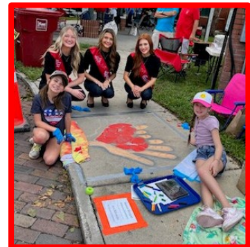
2022 Street Painting Participants